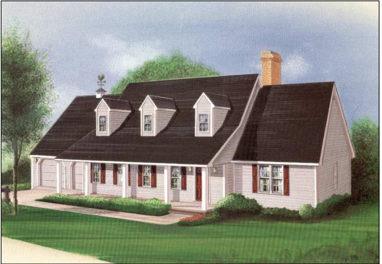
PLAN 2714 / ELEVATION "A"