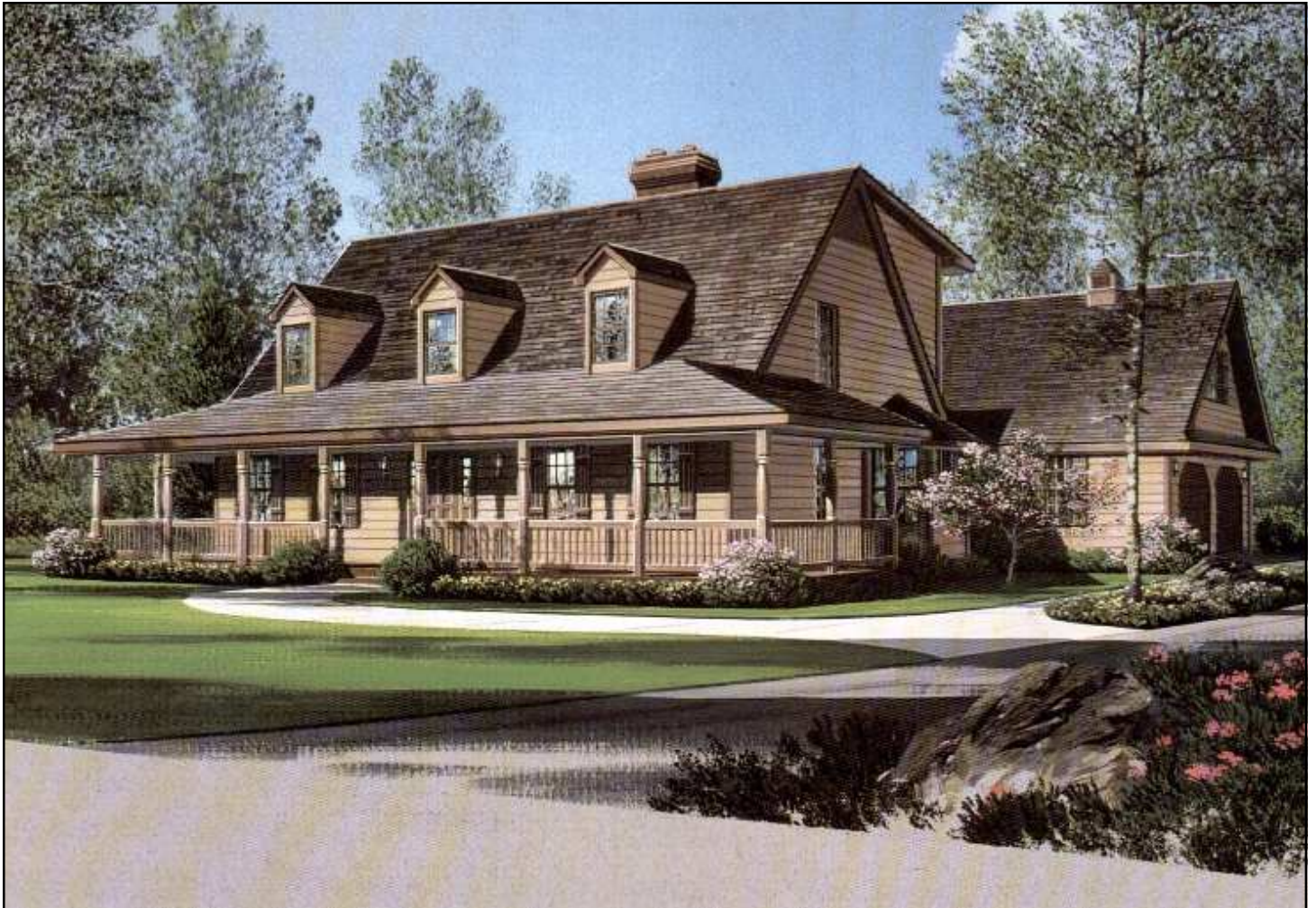
PLAN 2470 / ELEVATION "A"