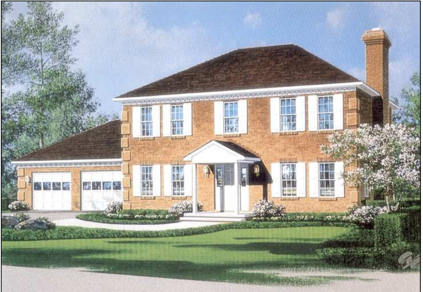
PLAN 2241 / ELEVATION "A"