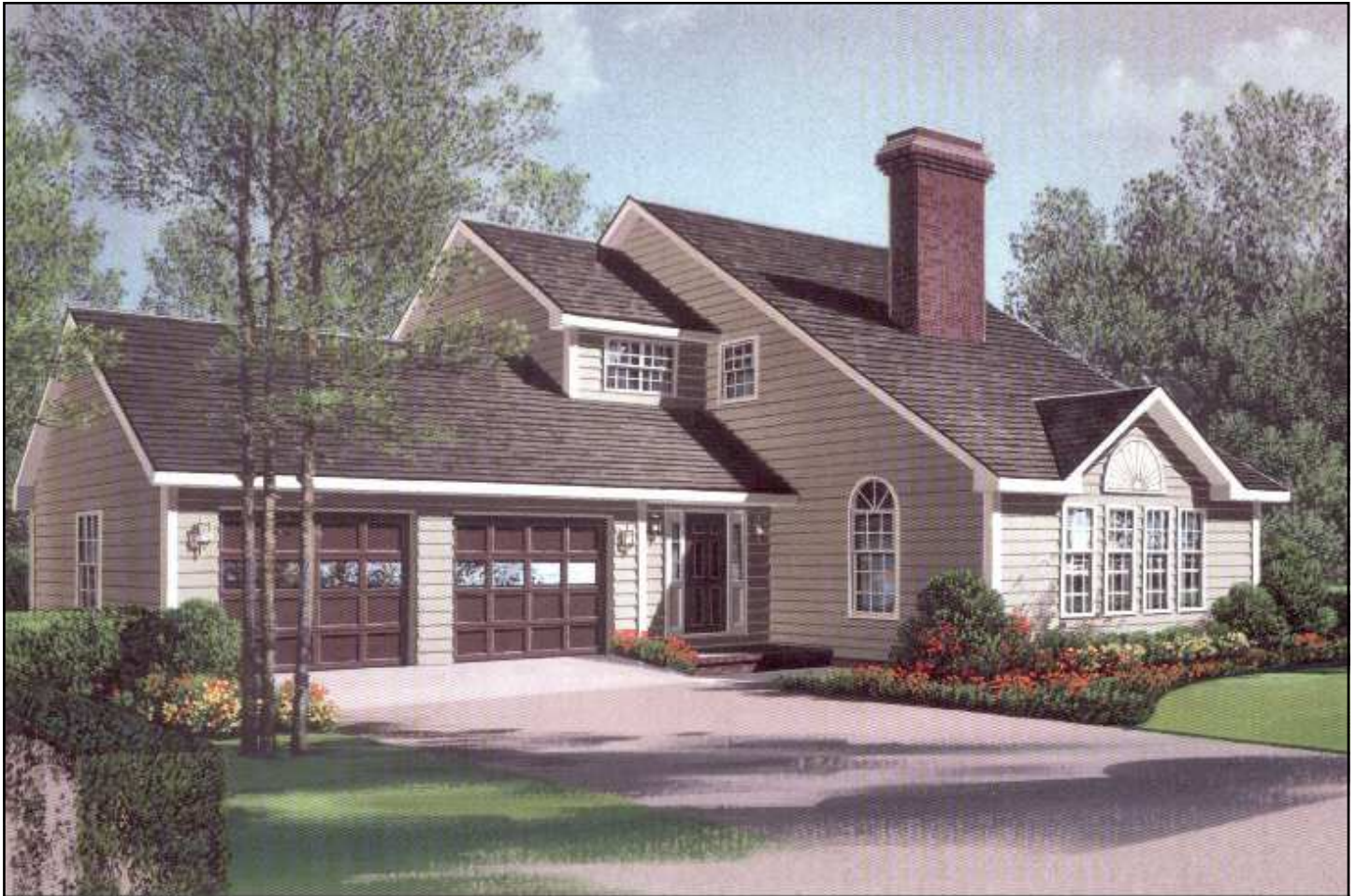
PLAN 2236 / ELEVATION "A"