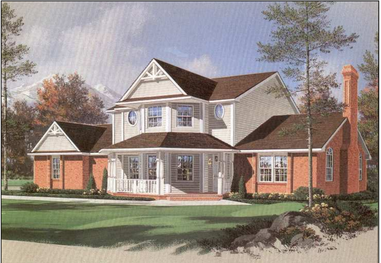
PLAN 2235 / ELEVATION "A"