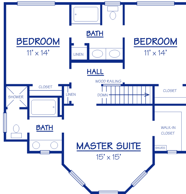
UPPER LEVEL Floor Plan

The Victorian influences and covered porch invite you to a truly beautiful home. This plan features: 3 large Bedrooms, formal Dining Room, Great Room with sloped ceiling, fireplace, window seat, bookshelves, and patio door leading to patio or deck. On the first floor, you'll also find a large Kitchen with an island and nook, a convenient study, laundry, and two-car garage. Upstairs you'll find the Master Suite prominently located and featuring a walk-in closet and large bath area.