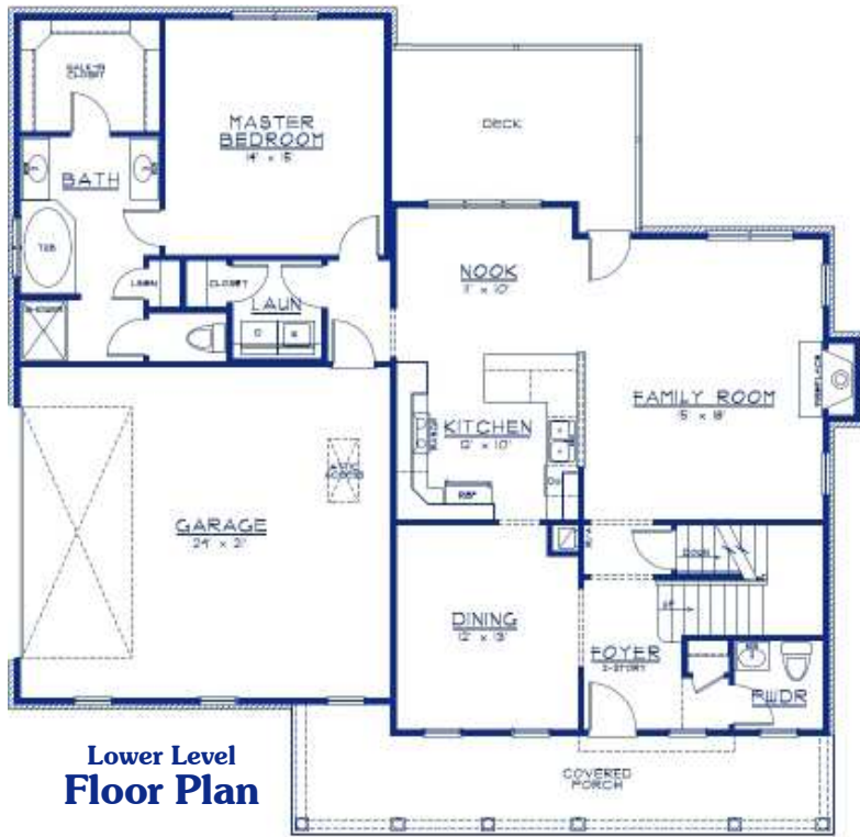
Lower Level Floor Plan