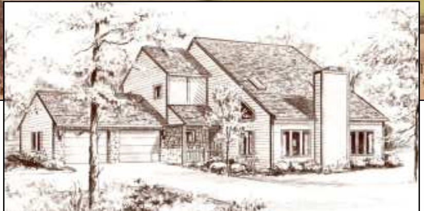
PLAN 2168 / ELEVATION "B"