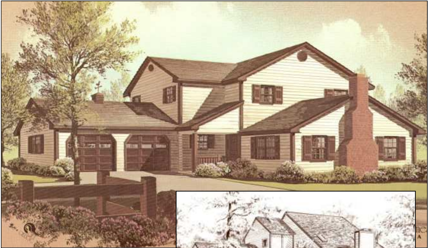
PLAN 2168 / ELEVATION "A"