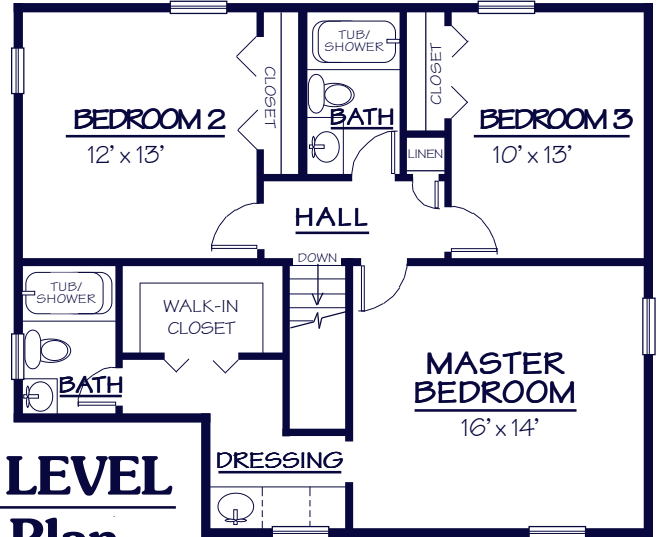
UPPER LEVEL Floor Plan

Rarely does a floor plan match as equally well with a traditional elevation as a contemporary elevation. However, with the Countryside, Plan# 2168, either elevation works equally as well. The openness of the Kitchen, Dining area, and Lounge creates a touch of informality to this home, much desired by today's families. The bar, desk, pantry and laundry room enhance this very functional plan. The Great Room adds the flair of a sunken floor and vaulted ceiling along with a beautiful fireplace. Another nice touch is the cozy dressing area off the Master Bedroom. The contemporary version has openings that look directly into the Great Room from the Master Bedroom. This home also offers the flexibility of a fourth Bedroom, study, library, or sewing/craft room on the lower level. All these features make the Countryside one of the true classics developed at Timber Truss.