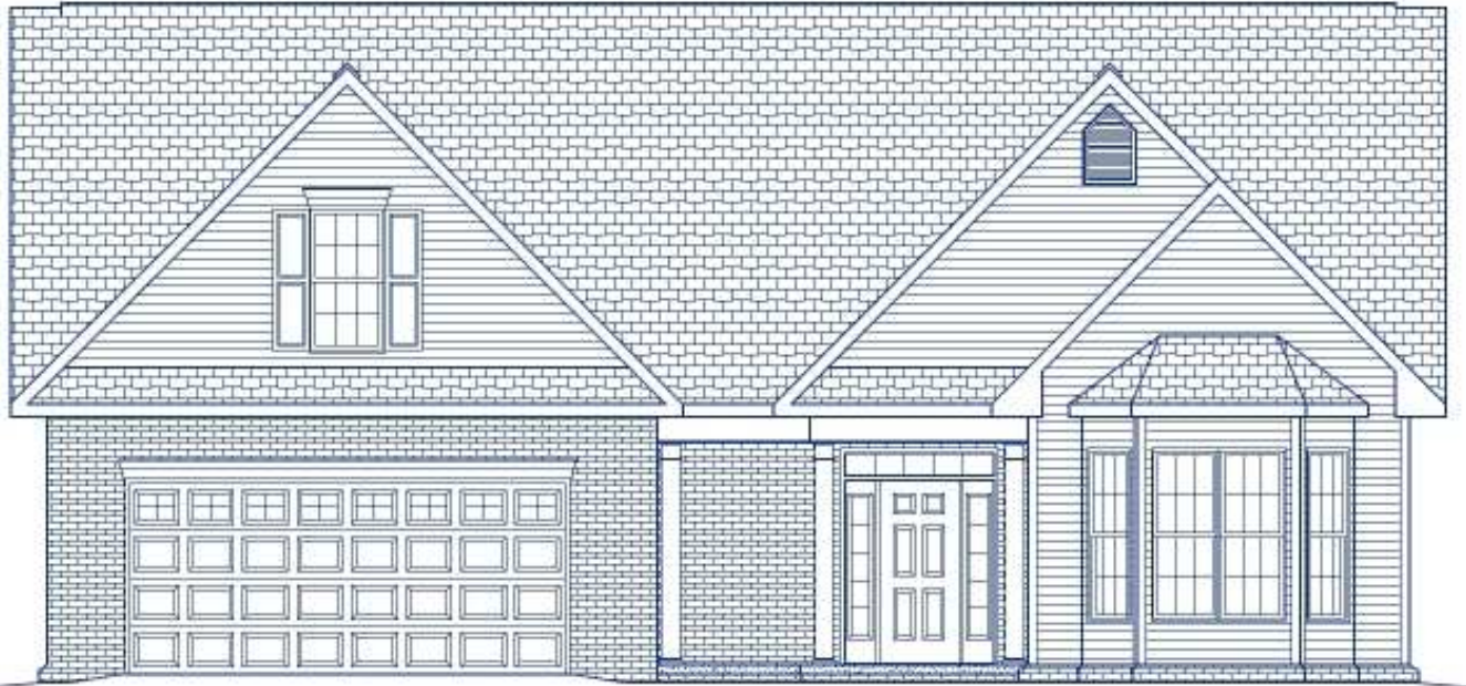
PLAN 2140 / ELEVATION "A"

WIDTH: 50'-0" DEPTH: 64'-0" LIVING AREA: 2,132 sq. ft.- (includes 280 sq. ft. Bonus Room)