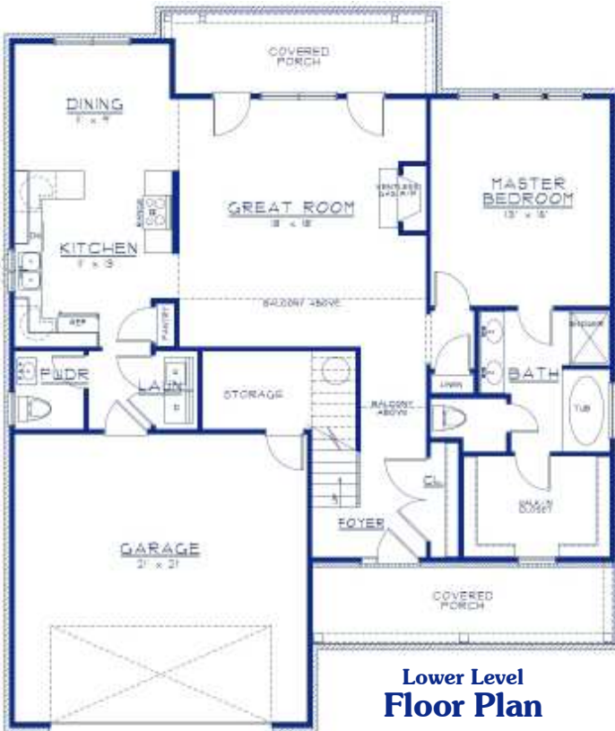
Lower Level Floor Plan

The "Wilshire", Plan# 2126, is a feature-packed 3 Bedroom, 2-1/2 Bath home. The plan features a 2-Car Garage, Master Bedroom on the lower level, spacious Master Bath, closet and dressing area, and a dramatic balcony overlooking the Great Room with fireplace. A Covered Porch is found at both the front and rear of the home. Two Bedrooms are upstairs and also a Bonus Room. Lots of storage space is also incorporated in this lovely home.