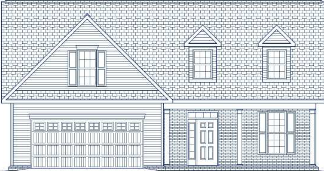
PLAN 2126 / ELEVATION "A"

WIDTH: 44'-0" DEPTH: 52'-0" LIVING AREA: 2,126 sq. ft.- (includes 216 sq. ft. Bonus Room)