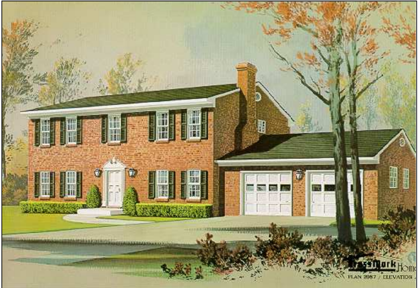
PLAN 2087 / ELEVATION "A"