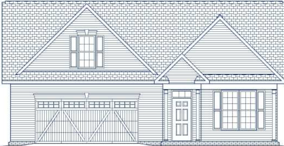
PLAN 1944 / ELEVATION "A"

WIDTH: 42'-0" DEPTH: 62'-0" LIVING AREA: 1,944 sq. ft.- (includes 284 sq. ft. Bonus Room)