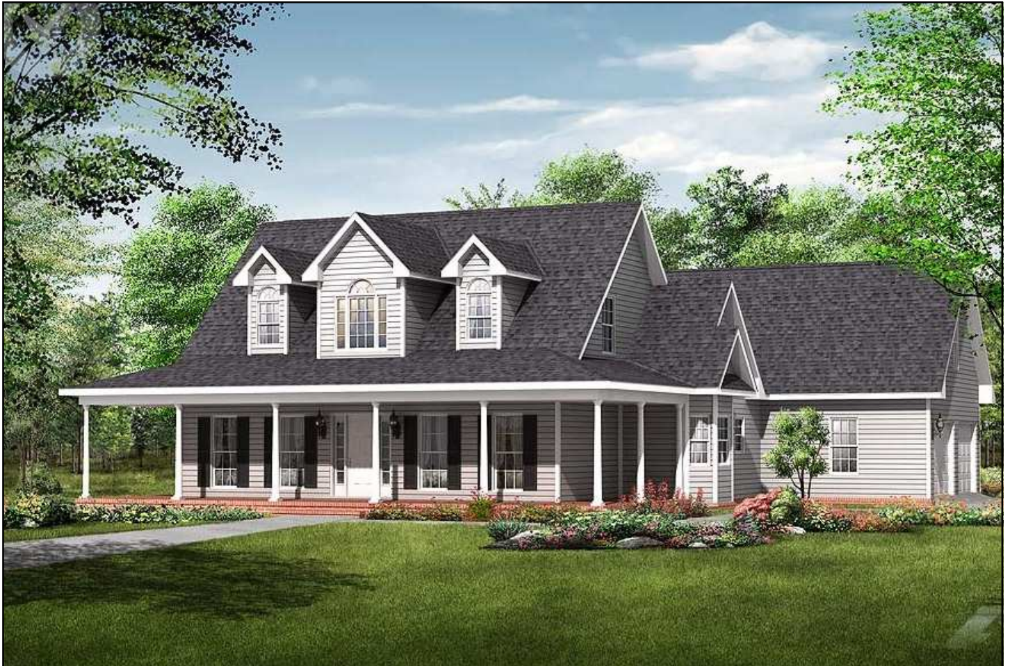
PLAN 1906 / ELEVATION "A"