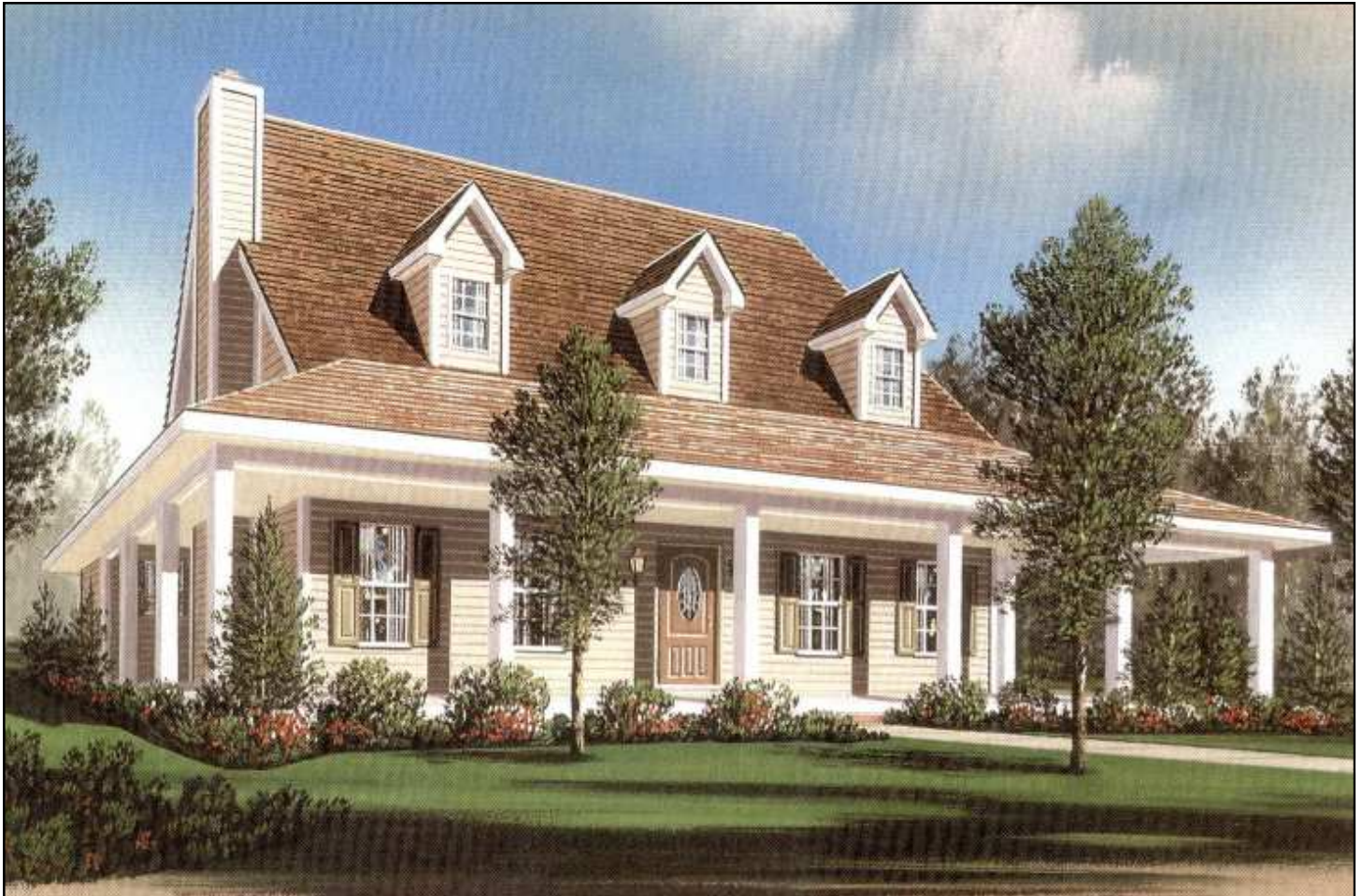
PLAN 1858 / ELEVATION "A"