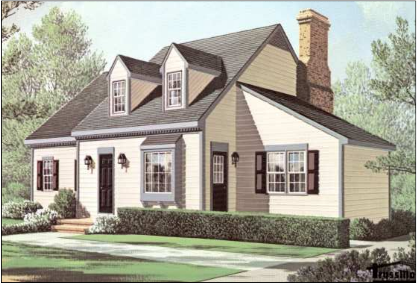
PLAN 1816 / ELEVATION A