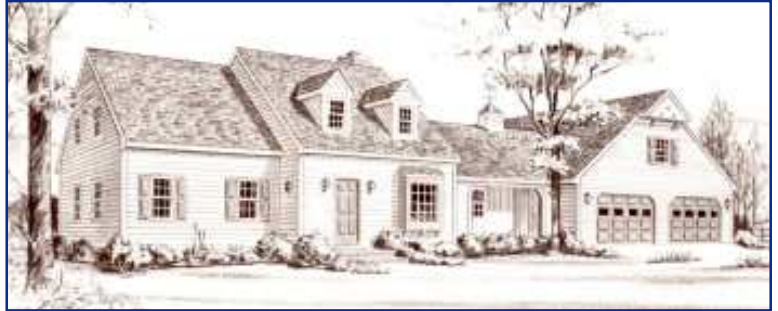
Plan 1816 (Frame) Elevation B Also available in brick version- 1817 Elevation B

The "Wakefield" Plan# 1816 is a 3 Bedroom, 2-1/2 Bath Cape Cod with several building options- the main house only, with Dining Room added, or with both Dining Room and Garage. The second floor can also be finished later if necessary, giving many budget options. A unique structural system allows for a unique Great Room/Kitchen combination that is very unusual for a Cape Cod design. The first floor provides all the essentials for a starting family or the "empty nesters". The floor plan features and the charming exterior elevations make this an outstanding home.