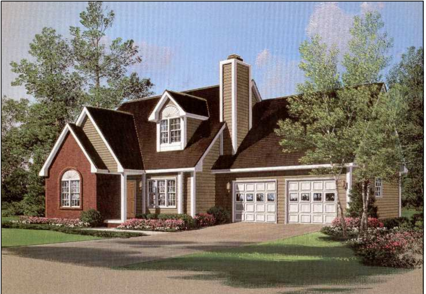
PLAN 1814 / ELEVATION "A"