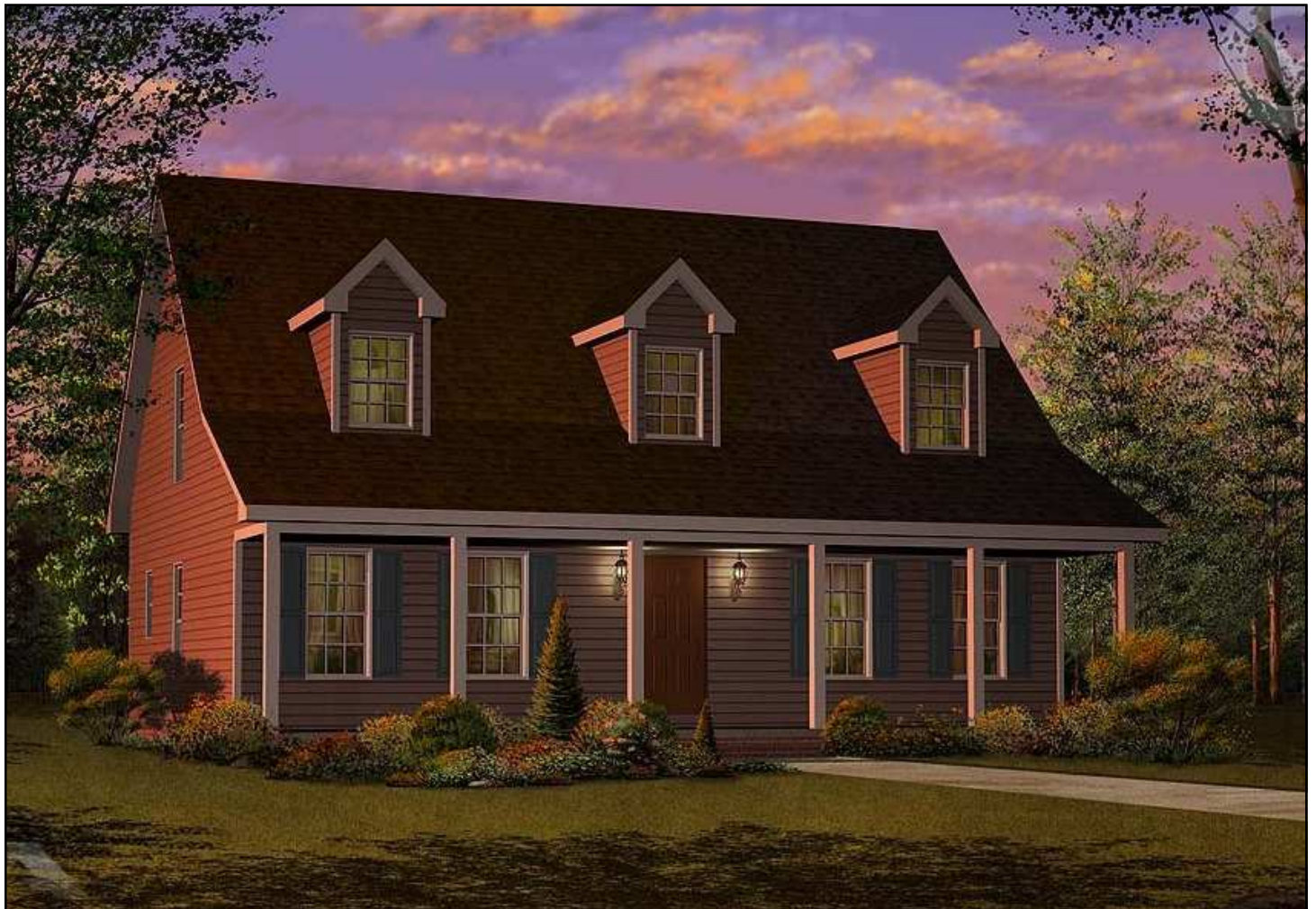
PLAN 1634 / ELEVATION "C"