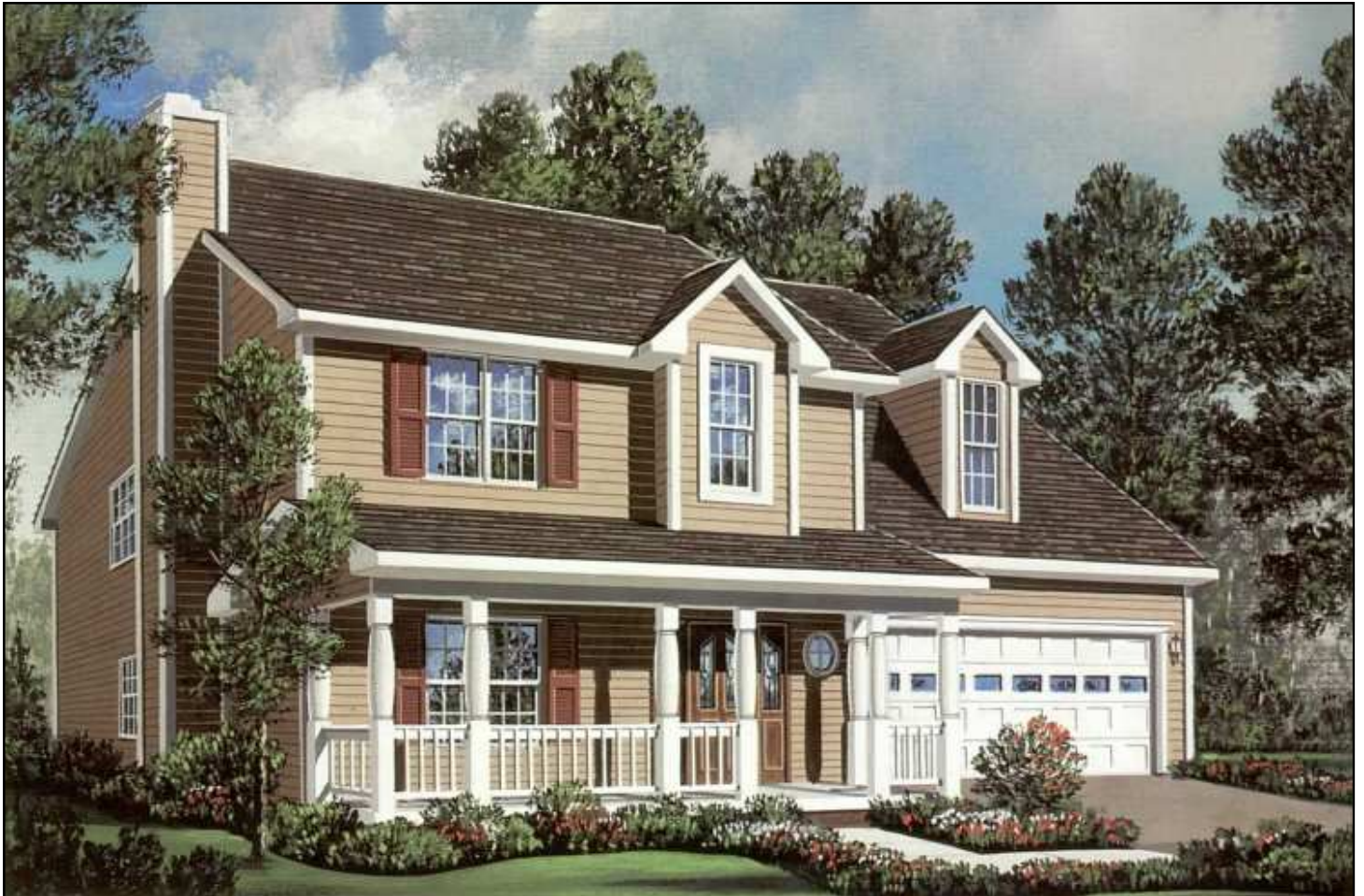
PLAN 1582 / ELEVATION "A"