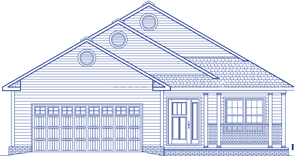
PLAN 1544 / ELEVATION "A"

WIDTH: 40'-0" DEPTH: 58'-0" LIVING AREA: 1,544 sq. ft.