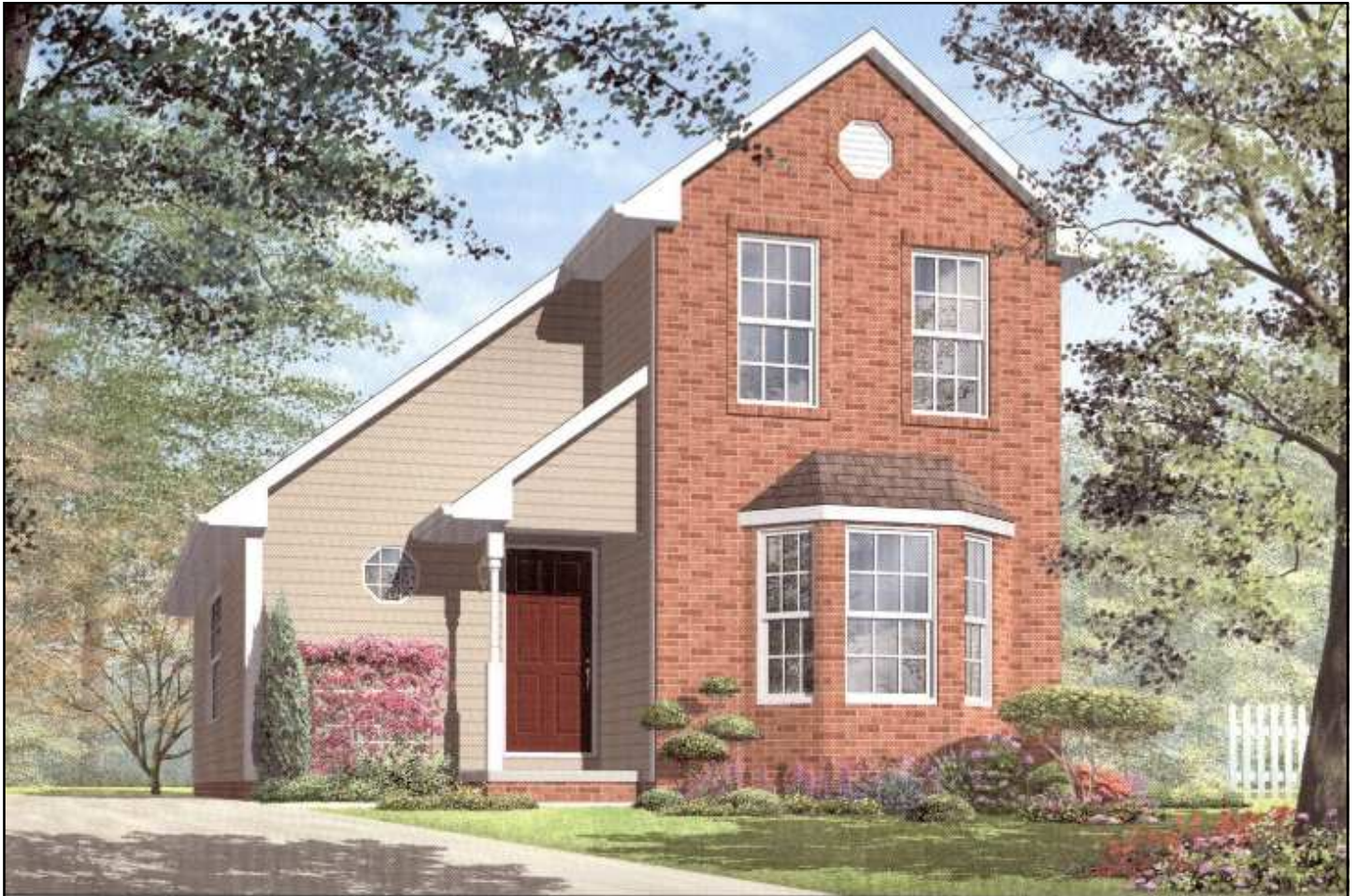
PLAN 1525 / ELEVATION "A"