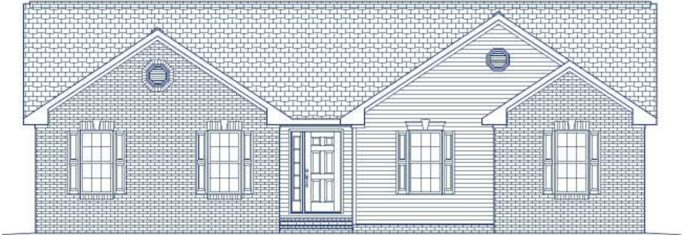
PLAN 1450 / ELEVATION "A"

WIDTH:50'-0" DEPTH: 34'-0" LIVING AREA: 1,450 sq. ft.