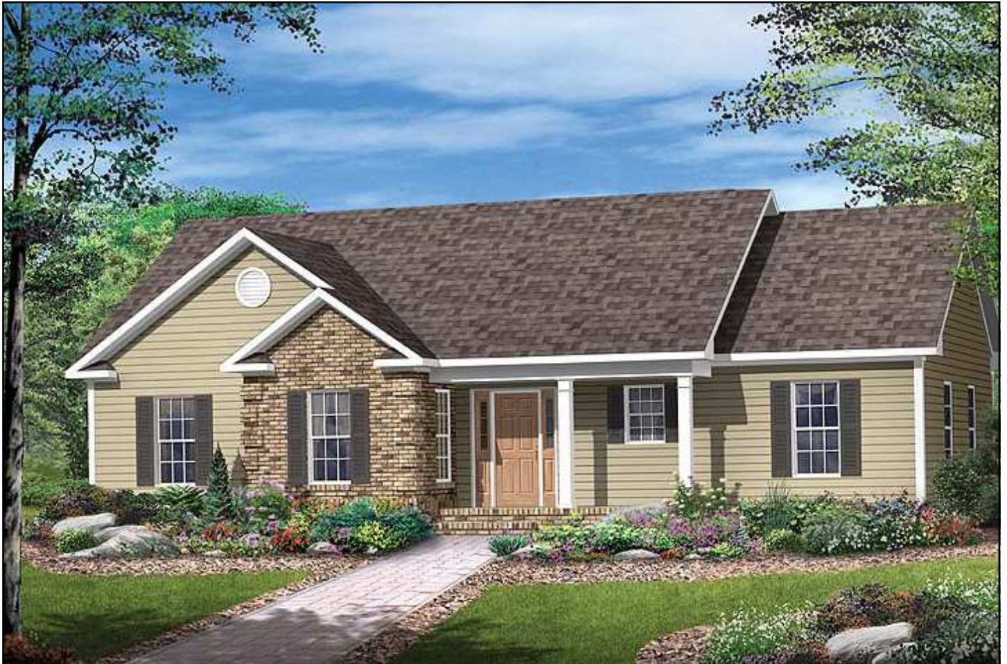
PLAN 1420 / ELEVATION "A"