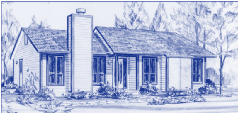
Alternate Elevation: Plan 1416 / Elevation "B"