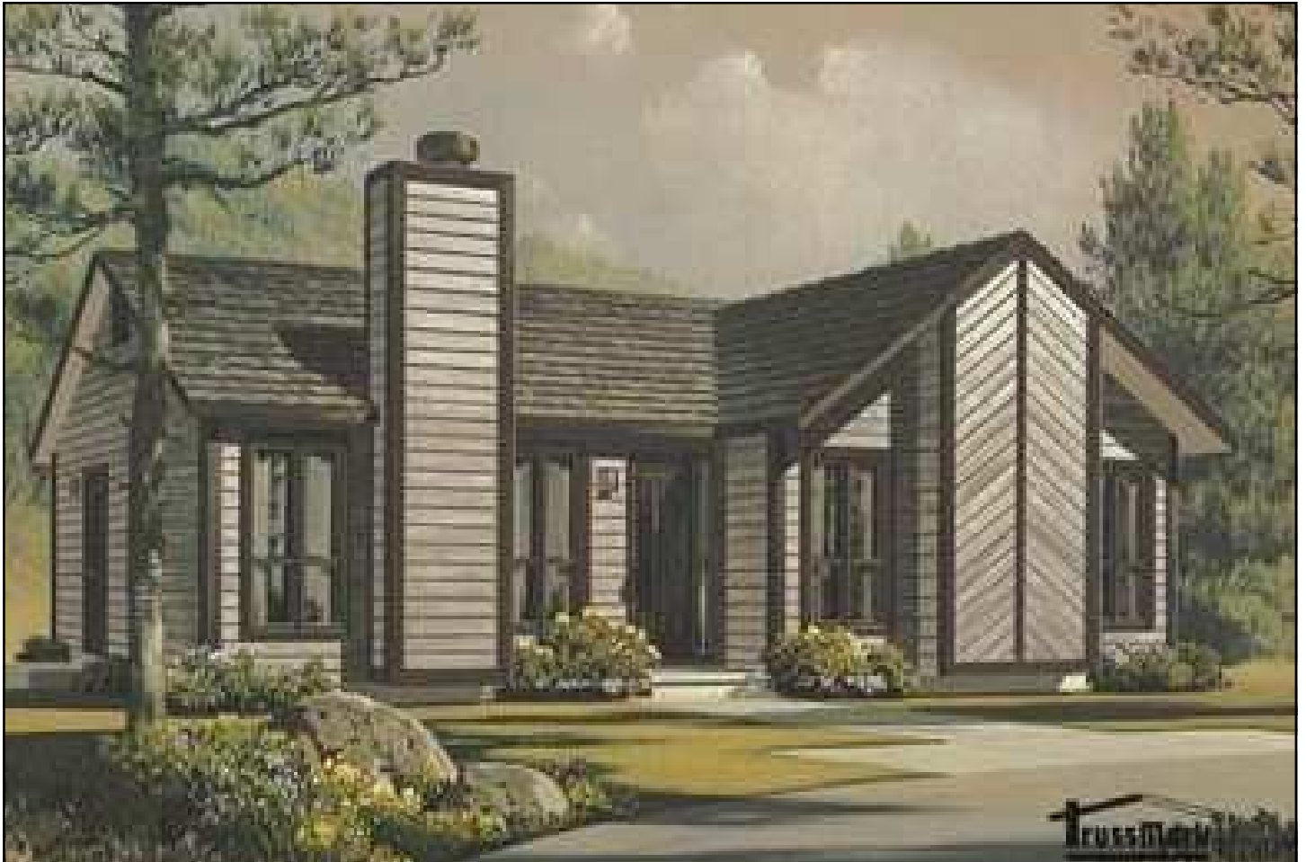
PLAN 1416 / ELEVATION "A"