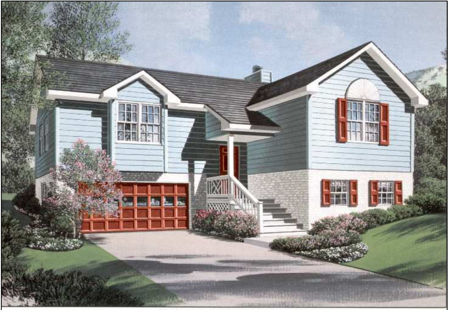
PLAN 1412 / ELEVATION "A"