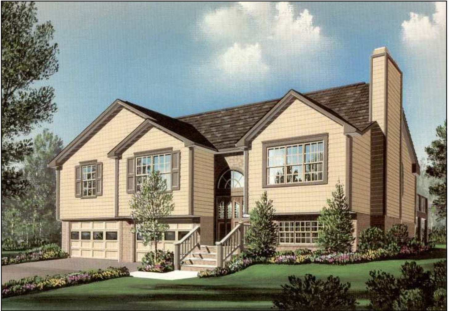
PLAN 1402 / ELEVATION "A"