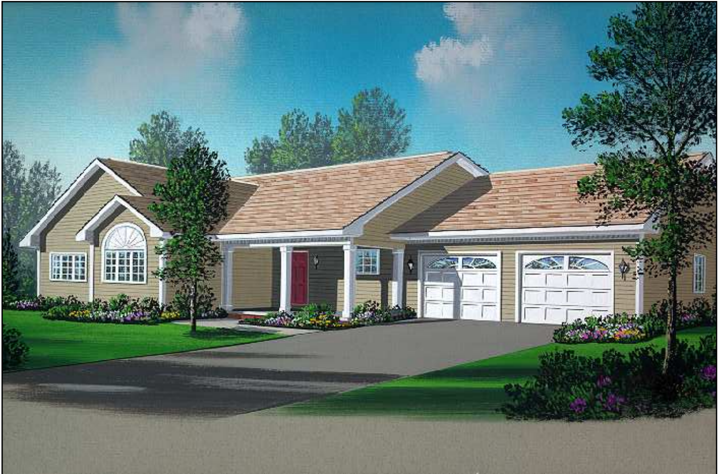
PLAN 1388 / ELEVATION "A"