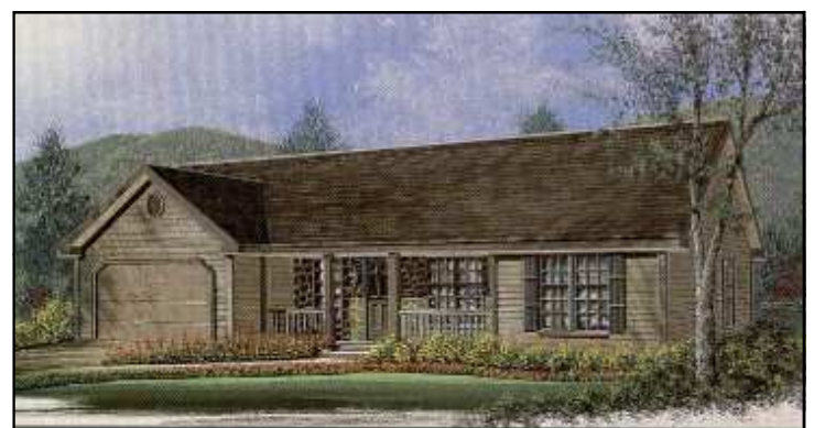
PLAN 1384 / ELEVATION "B"