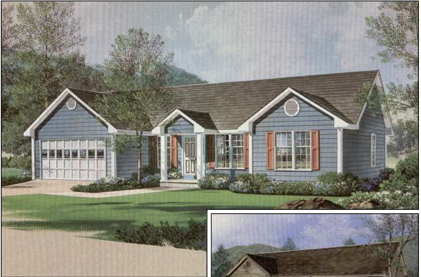
PLAN 1384 / ELEVATION "A"