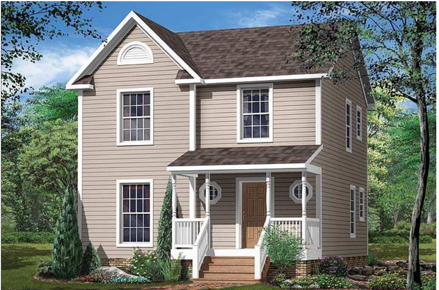
PLAN 1346 / ELEVATION "A"