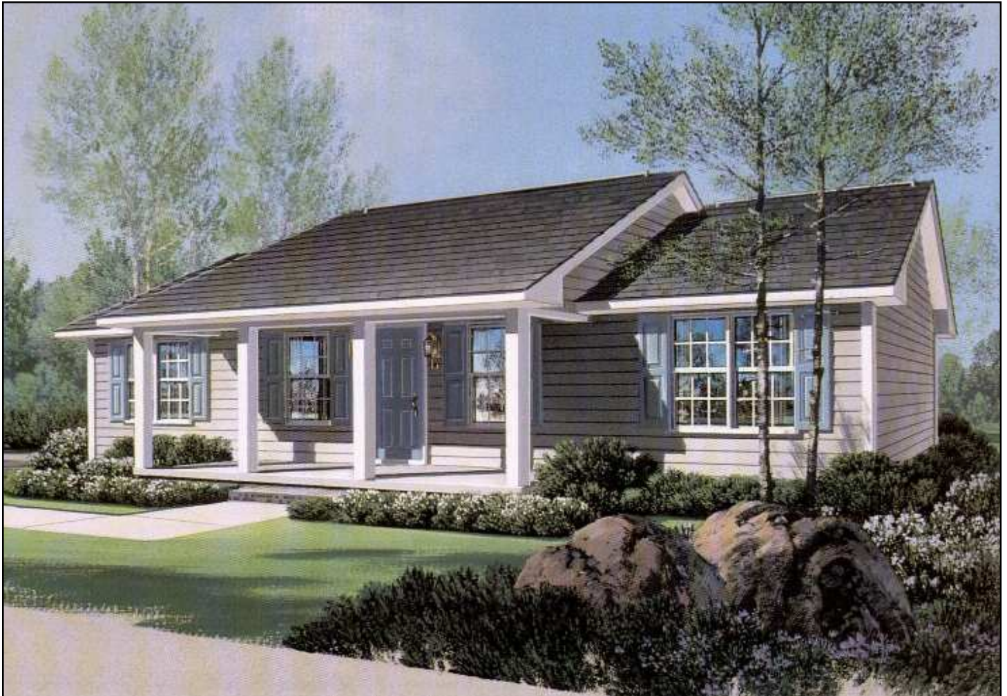
PLAN 1344 / ELEVATION "A"