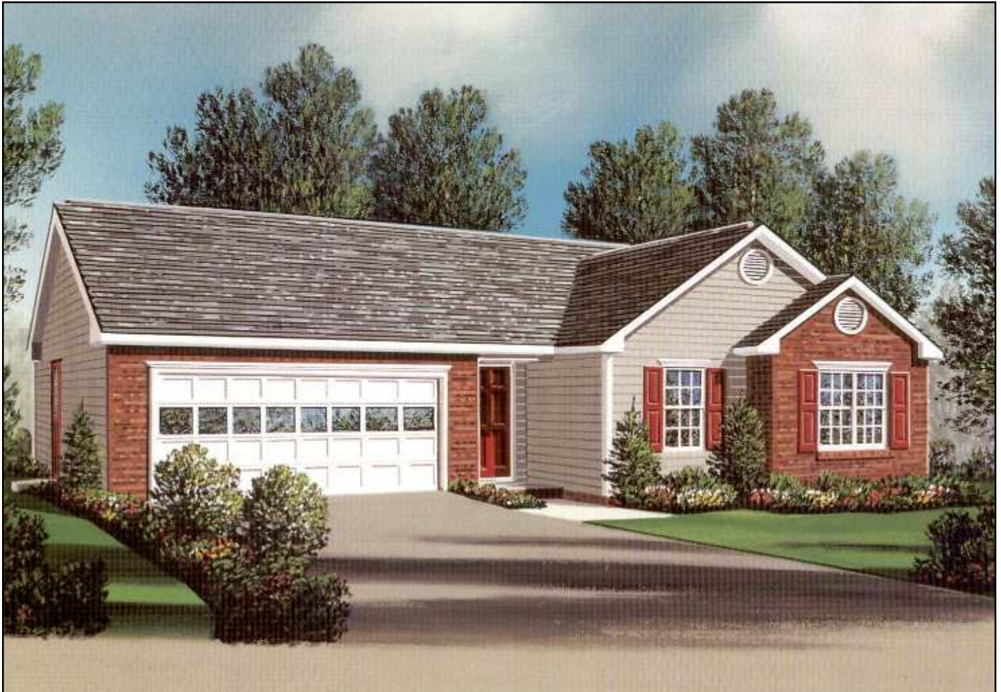
PLAN 1282 / ELEVATION "A"