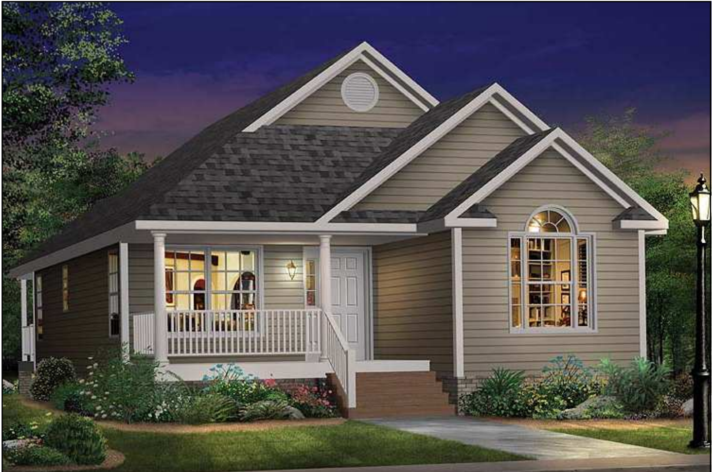
PLAN 1238 / ELEVATION "A"