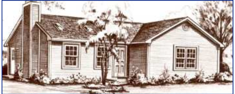
Alternate Elevation "B"

The "Sierra" Plan 1214 is one of the most efficiently designed TrussMark Homes. Among the desirable features are: a bar separating the Kitchen and Great Room make a great entertaining feature, the vaulted ceiling with skylights and the cozy and energy efficient fireplace. The laundry area is conveniently located to the 3 Bedrooms which all have very adequate sized closets. Using 2x6 exterior walls would make this home well insulated and very energy efficient. Available in three unique elevations, the "Sierra" makes a smart choice for a small, efficient home.