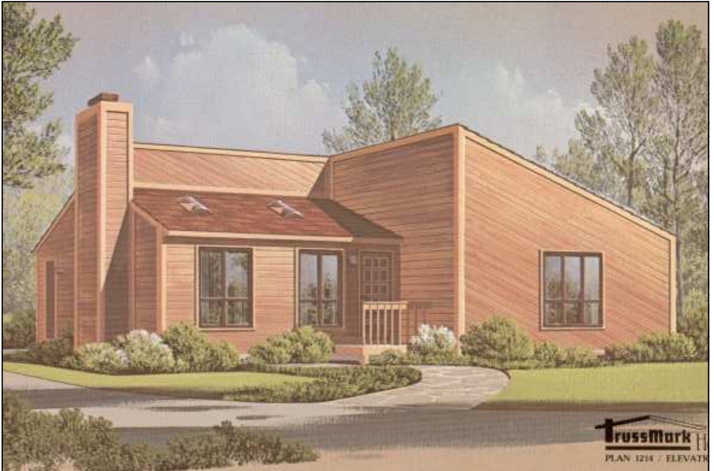
PLAN 1214 / ELEVATION "C"