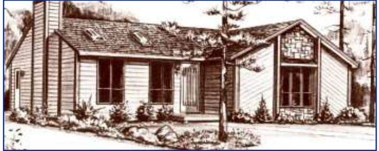
Alternate Elevation "A"

The "Sierra" Plan 1214 is one of the most efficiently designed TrussMark Homes. Among the desirable features are: a bar separating the Kitchen and Great Room make a great entertaining feature, the vaulted ceiling with skylights and the cozy and energy efficient fireplace. The laundry area is conveniently located to the 3 Bedrooms which all have very adequate sized closets. Using 2x6 exterior walls would make this home well insulated and very energy efficient. Available in three unique elevations, the "Sierra" makes a smart choice for a small, efficient home.