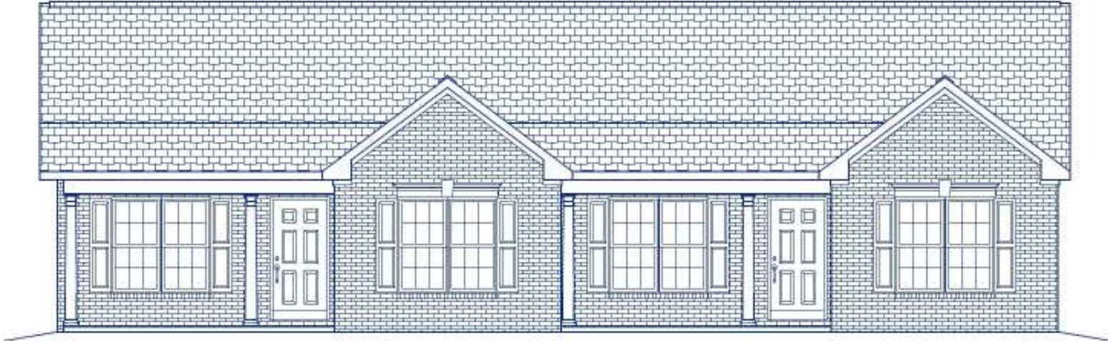
PLAN 1144 / ELEVATION "A"

WIDTH: 28'-0" DEPTH: 50'-0" LIVING AREA: 1,144 sq. ft.