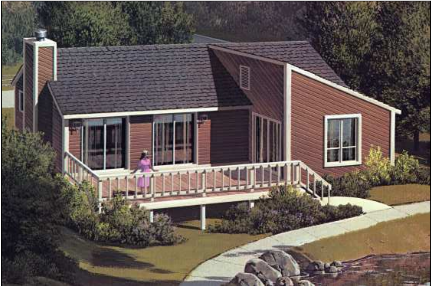
PLAN 1136 / ELEVATION "A"