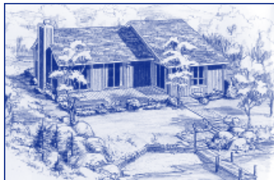
Alternate Elevation: Plan 1136 / Elevation "B"

The "Lakeview", Plan# 1136 is large enough for year-round living yet small enough for weekends at the lake. This home was specifically designed with local desires in a lake home. The large Great Room, adjoining Kitchen and Dining Room, promote comfortable and informal "lake living". Entertaining guests is a pleasure with the openness and flow to the huge outside deck. The vaulted ceiling further adds to the openness of this home. If built with a basement, expansion for added living space would be very simple. The features and striking exterior of this plan make it perfect for your lake or mountain vacation home.