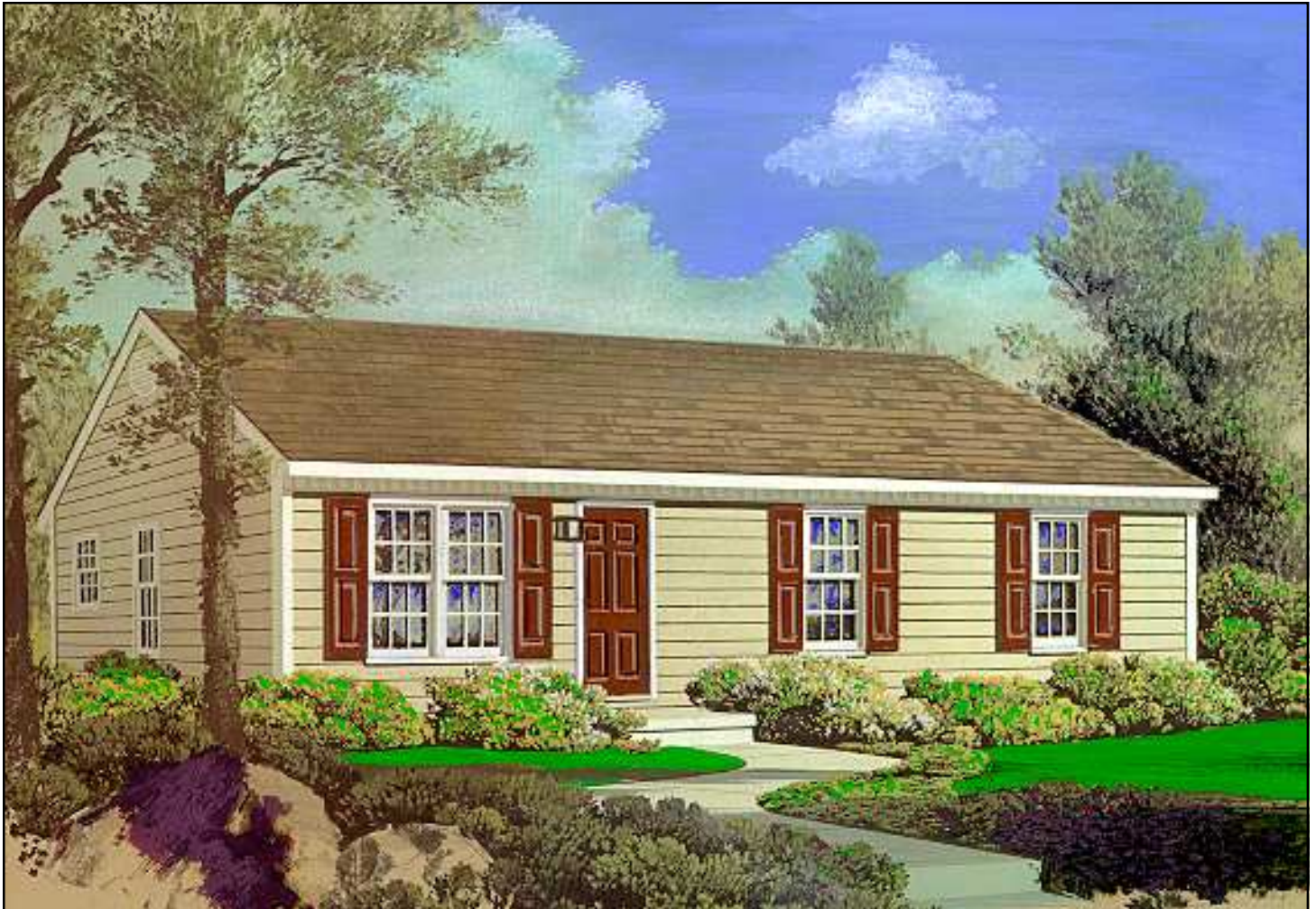
PLAN 988 / ELEVATION "A"