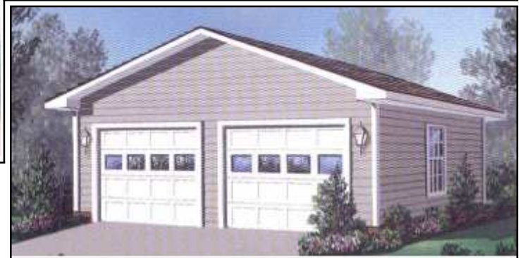
PLAN 576 / ELEVATION "A"