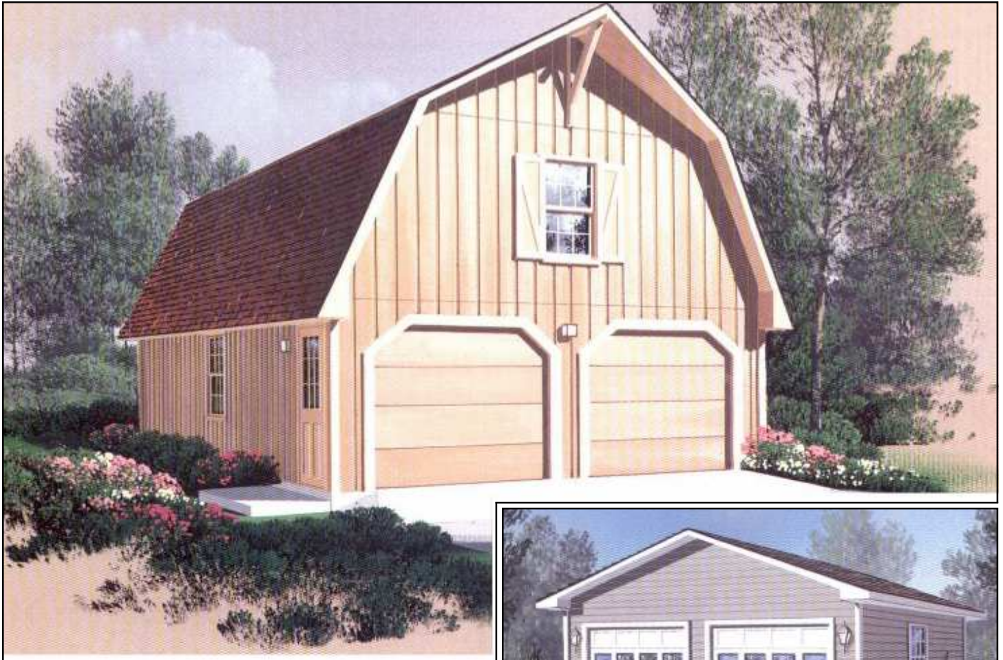
PLAN 1280 / ELEVATION "A"