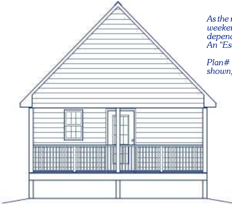
PLAN 440 / ELEVATION "A"

WIDTH: 20'-0" DEPTH: 28'-0" LIVING AREA: 440 sq. ft.